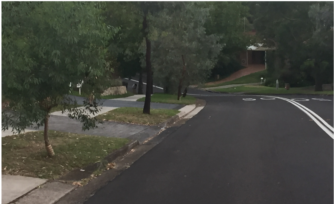
Approach along Middleton Avenue, highlighting blind spot area for drivers coming out of the proposed Cadman Crescent connection. This new road will not be visible to drivers coming along Middleton Avenue until they are only metres away from the new road.

The proposed road extending Ashford Avenue to create a connection between Middleton Avenue and Hughes Avenue is in a safer location due to existing sight lines that provide good