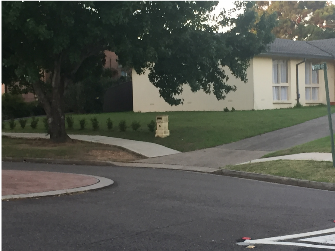
Existing roundabout at Ashford Avenue

visibility and would take advantage of the existing roundabout at the intersection of Ashford Avenue and Middleton Avenue.